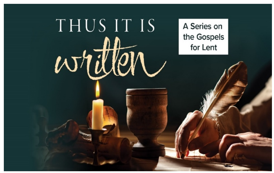
Worship at 7pm Preceded by Soup and Bread at 6pm